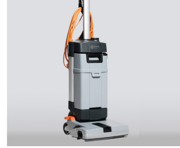
19. Clean the squeegee bars and the 20. Clean the machine using a damp cloth and where needed use a neutral cleaning product. Then store the machine in a clean and dry place.

(*) ALWAYS FOLLOW THE DETERGENT DOSING RECOMMENDATION ON THE LABEL OF THE CHEMICAL PRODUCT USED.