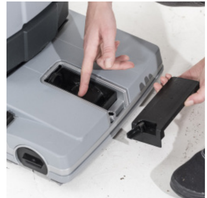
3. Check if the inspection compartment is dirty.