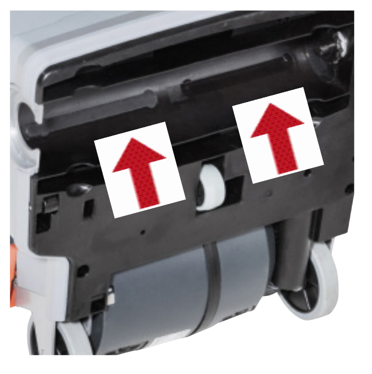
dispensers are clogged. Remove them and clean if needed.