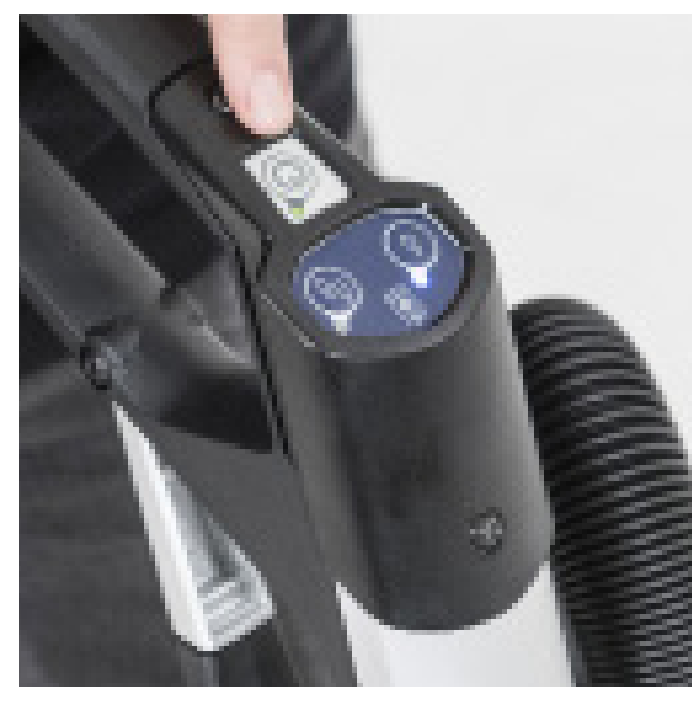
3. The push button panel is broken.

(*) For these causes the maintenance procedure must be performed by an authorised Nilfisk Service Center.