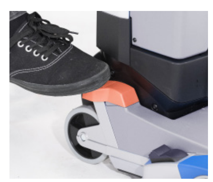
6. Use the orange pedal to put the machine in working position.