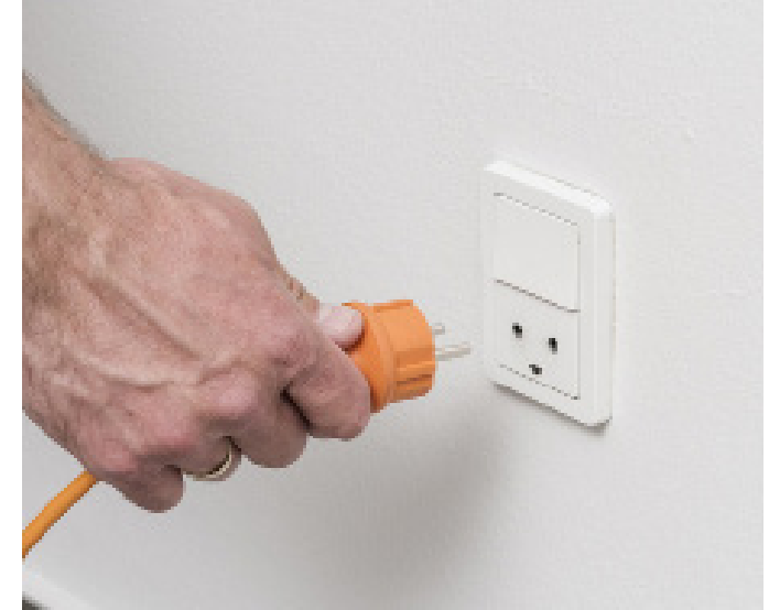
4. Connect the power plug to the electrical socket.