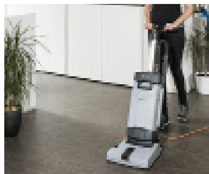
9. Move the machine with the handle and start cleaning the floor.