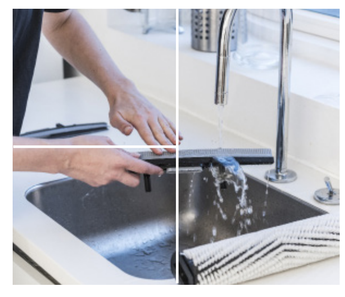
cylindrical brush with water.