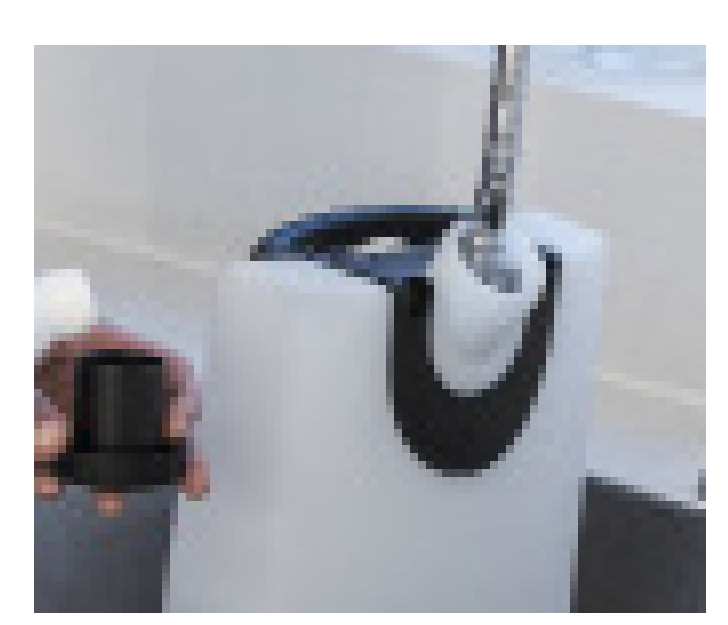
1. Release the handle to remove the 2. Fill the solution tank with a clean 3. The tank cap can be used for water. The clean water temperature must not exceed 40 °C.