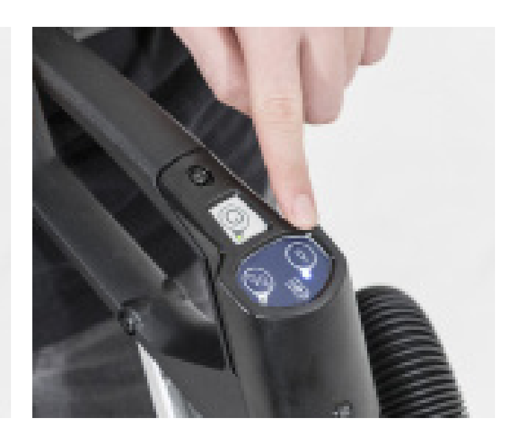
8. PPress one of the solution buttons, according to the type of cleaning to be performed: 1 drop - normal cleaning 2 drop - heavy duty cleaning