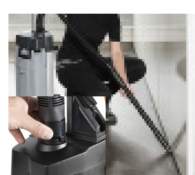
12. To use the manual suction hose press the main button to start the machine in upright position. Turn the hose connection to ON and use the suction tube. When done press the main button and turn hose connection to OFF. (**)