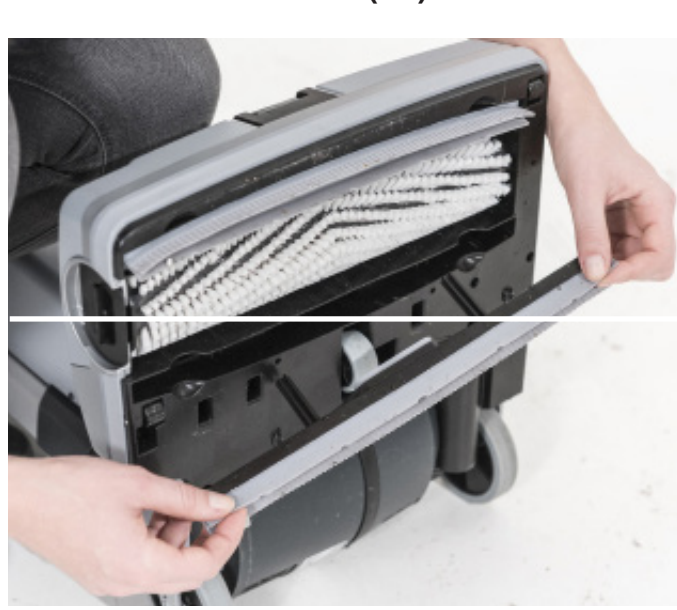
17. Remove the squeegee bars.