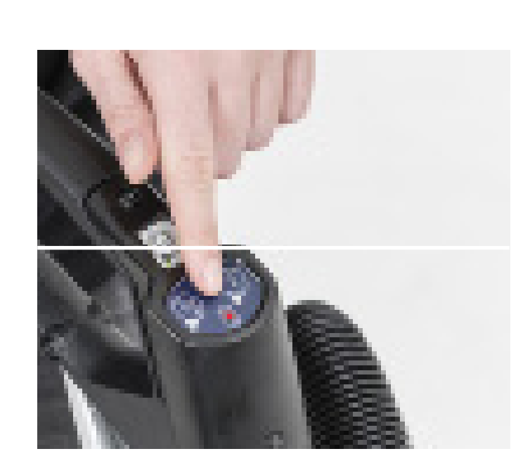
11. The red LED blinks when the machine is getting low on solution and fixed light when empty. Empty the recovery and refill the solution tank to continue working.