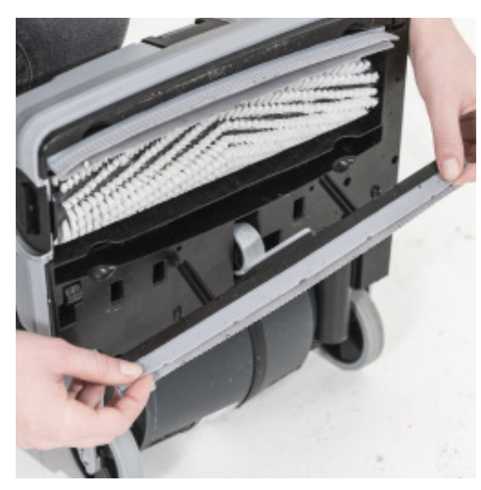
2. Check if the squeegee bars are dirty or the blades are worn or damaged.