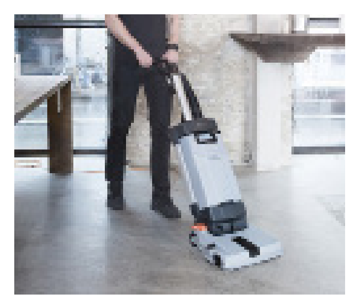
13. Park the machine in upright position. If needed turn off the machine by pressing the main button. Press the main switch to "0".