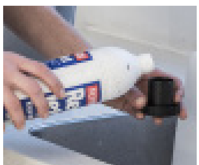
dosing the detergent. One full cap is 30ml giving 1% detergent of the 3L tank capacity. (*)