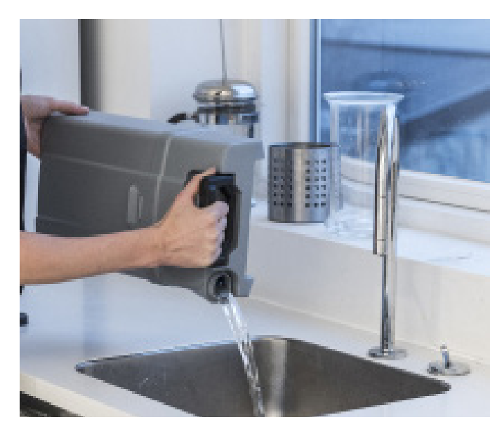
15. Empty the recovery and solution tank. Clean them with water.