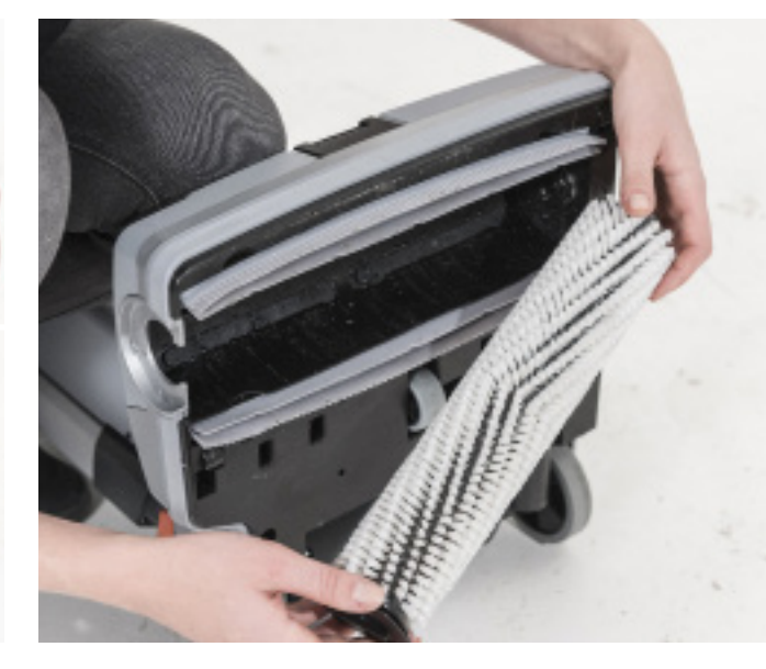
18. Unscrew by turning the knob clockwise to remove the cylindrical brush.