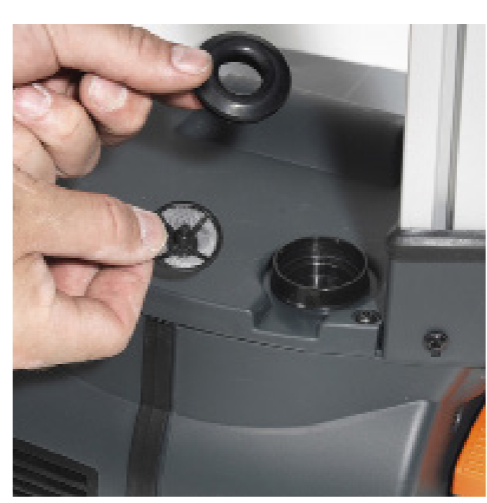
2. Check if the solution filter is dirty. 3. Check if the holes in solution Clean it if needed.