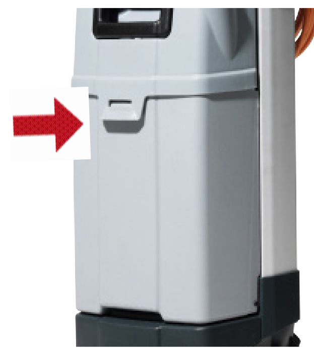
1. Check if the recovery tank is full.