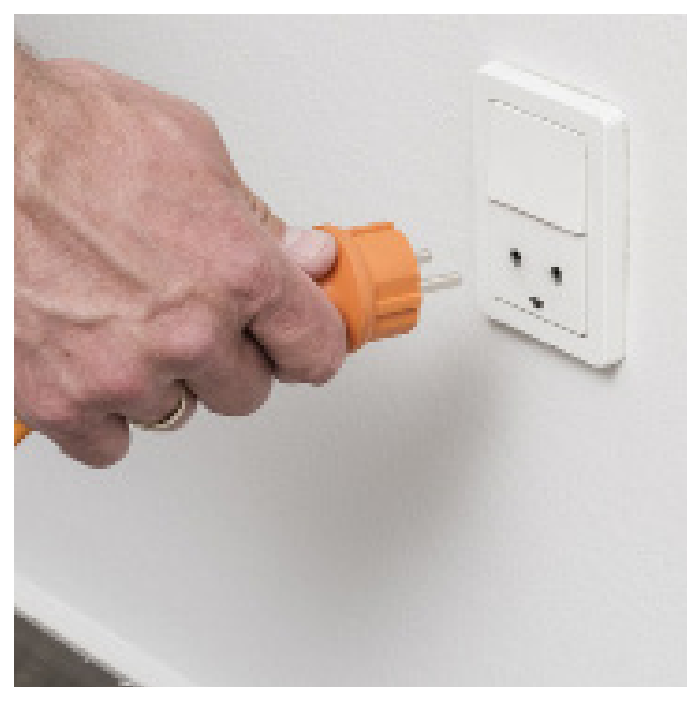
1. Check if the power supply cable is 2. The main switch is broken. (*) damaged, faulty or disconnected from the electrical mains.