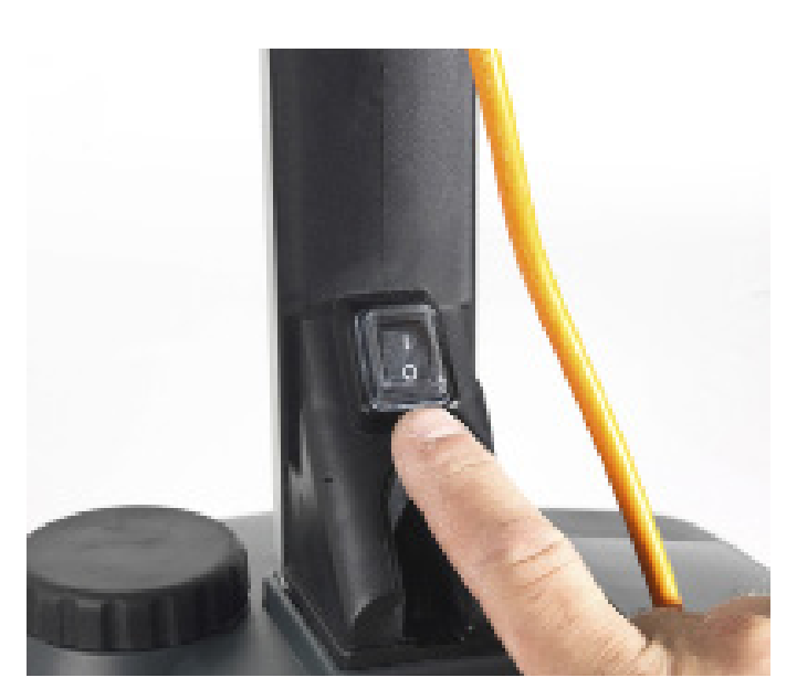
5. Turn on the machine with the main switch to "I".