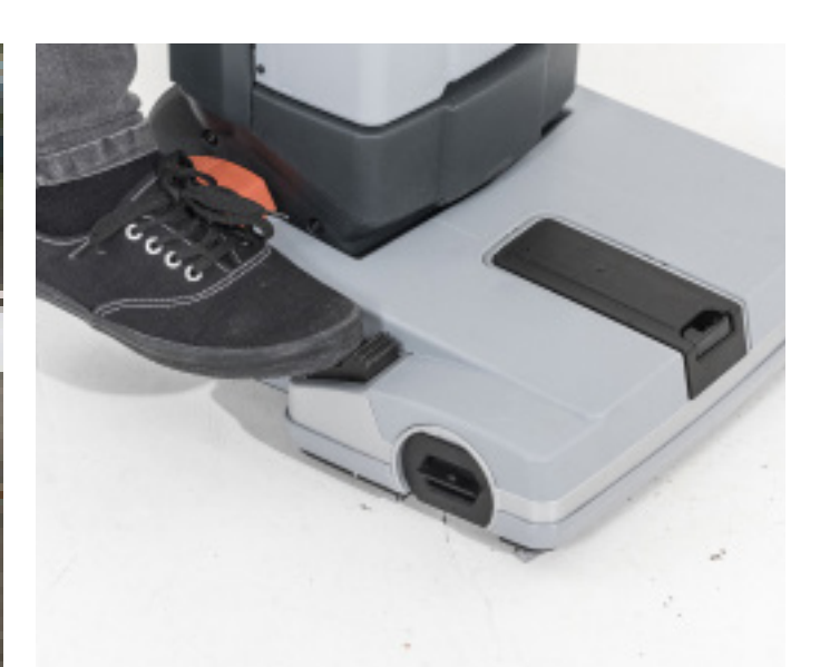
10. For double scrubbing, use the pedal to lift/lower squeegees.