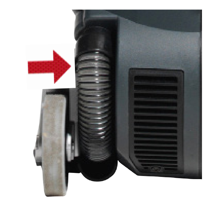
4. Check if the recovery vacuum hose is disconnected or dirty.