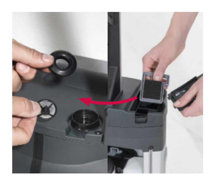
16. Check and clean the solution and vacuum filter regularly.