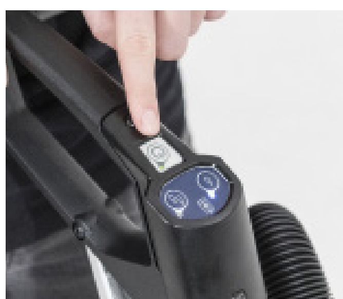
7. When machine is in working position press the main button and start cleaning. Machine will automatically stop when parked upright.