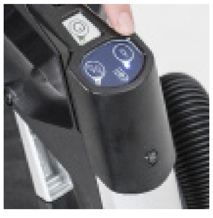
1. Check if you have the right detergent solution settings or the solution tank is empty.