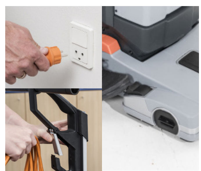
14. Disconnect the power plug from the electrical socket and rewind the cable from the machine and place it in the cable holder.